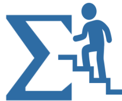
Cumulative & Multi-Step Campaigns